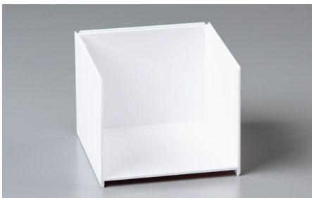
OPEN STORAGE CUBE 149171 $17.75 AUD | $21.00 NZD

Set of 5 white plastic trays. Each tray stores 6 Stampin' Blends markers. Stack several trays together or combine with other storage products. Peel-and-stick silicone feet are included to protect your surface and prevent slipping. Each tray: 5" x 5" x 7/8" (12.7 x 12.7 x 2.2 cm).